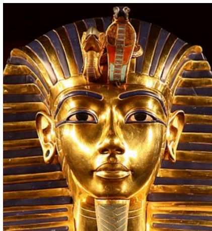
Mask of King Tutankhamun with both a cobra (right) and a vulture (left), Symbolizing his authority over both united halves of Egypt.

Pharaoh interfacing with Moses and Aaron in Egypt had great pride, believing he and his gods were wiser and more powerful than the Great God of the Hebrews. Because of it and his disobedience there was great suffering in Egypt among all but the Israelites.