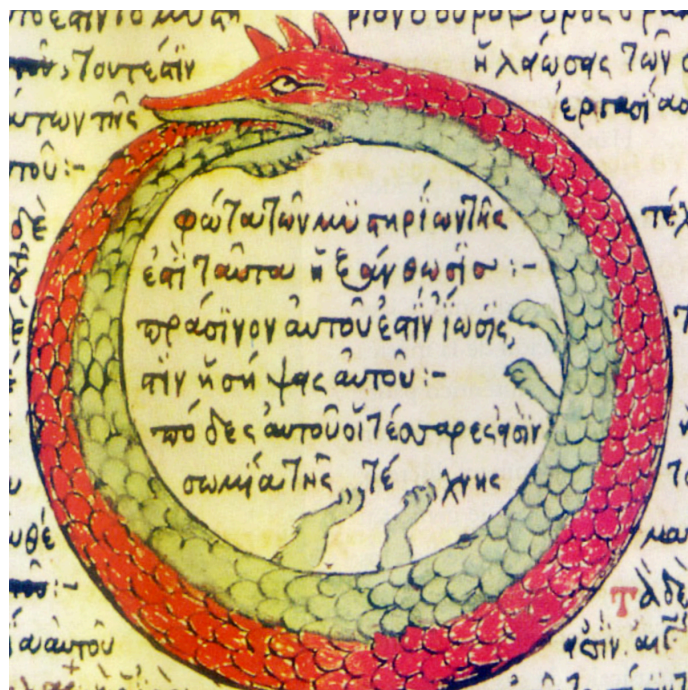
Early Ouroboros Illustration, 1478 AD