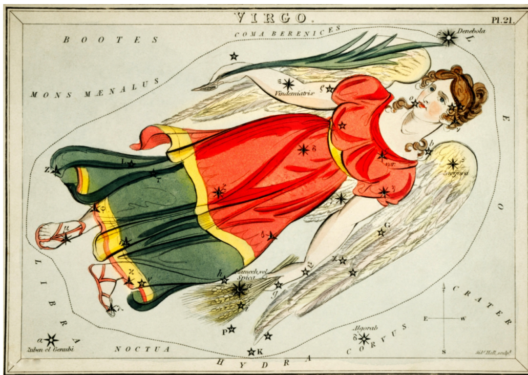
Illustration of the Constellation Virgo. Note that she has wings and that she is holding a sprig of wheat in her left hand. Located there is the bright star Spica, “the star out of Jacob” (Num. ). He is Jesus, the fruit of her womb. She as Mother in Heaven or “Wisdom” has healing in her wings in the original Hebrew of Malachi 4:2. She is the righteous “Sun Lady,” full of Light or the Spirit in Revelation 12. Many believe she is not only “Wisdom” but the feminine aspect of the Holy Spirit throughout scripture.

Then in verse 35, Jesus described the sinners and tax collectors as “Wisdom's children.” I have capitalized “Wisdom” to reference Mother in Heaven. Her children follow Her ways, that of the Holy Spirit (“Wisdom” is one of Mother's many names). The Jewish religious leaders did not follow her ways. Jesus called them “children of their father, the Devil” (John 8:41–44). Wisdom (the Spirit – Mother) has spoken to the more humble ones, encouraging them to repent of their sins. They listened and obeyed Her, John, and the LORD. She, “Wisdom” is presented to us in Luke 7:35 and throughout much of the Proverbs of Solomon. There she is the personification of “right thinking” (a focus in the book of Proverbs), directly coming from the nature of “God” and the Holy Spirit uniting them all (Father, Mother, Son and Spirit, see Proverbs 1:7). With Her influence and that of the Spirit generally, one has “wisdom” and is “justified” in the sense of being proven correct. This is the same way in which God is declared as “just” in Luke 7:29. The choice of those who listened and accepted God's teachings, through Messengers like John the Baptist and others, reveals the truth, light, and Spirit in their messages. Here “God” is defined as “Mother” or “Wisdom,” as well as Father and Son. All three are “God” in scripture. All three operate in unity in the Spirit of truth and wisdom and love.